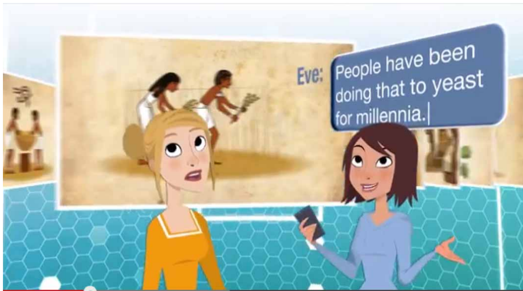
Figure 2. When Evolva, a company that says it is using synthetic biology to produce vanillin, faced public controversy, it published a video that conjured up their imagined public.

fulfilling: only concerns about the unnaturalness or narrowly defined risks of GM technologies are acknowledged as relevant. Other concerns are batted away.