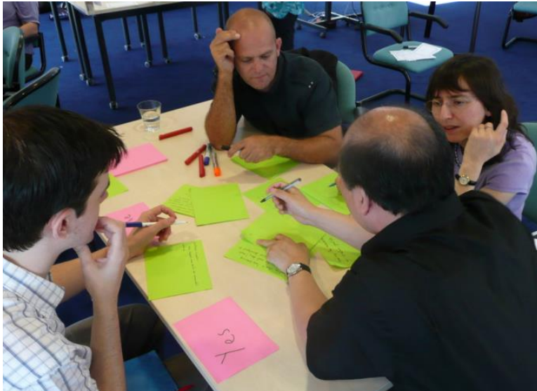
Figure 1: A group in deep thought generating examples of serendipity