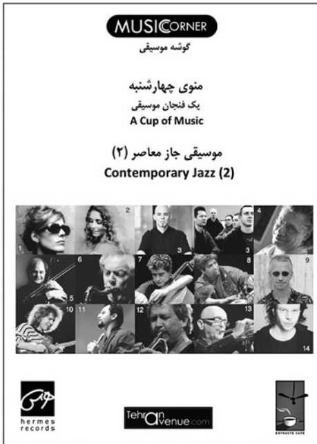
FIGURE 4.1. Program for A Cup of Music (2008).