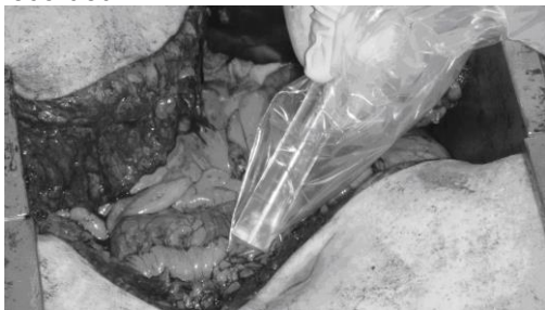
Fig. 1. Fibre-optic splanchnic PPG probe being held on the small bowel by the surgeon during open laparotomy

Ethics Committee approval was obtained to study patients undergoing elective laparotomy. At an appropriate time during the procedure, the splanchnic PPG sensor was inserted into a sterile medical ultrasound cover. The sensor was then placed on the surface of each accessible organ by the surgeon (Figure 1). An identical fibre-optic sensor was also placed on the periphery (finger or toe) of each patient to facilitate comparison of the acquired PPG signals from both sites. All signals were monitored and acquired for approximately two minutes on each site. Blood oxygen saturation from a commercial finger pulse oximeter (GE Healthcare) was also simultaneously monitored and recorded.