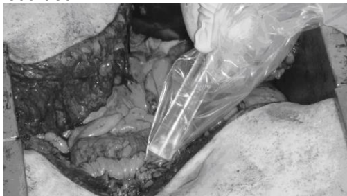
Fig. 1. Fibre-optic splanchnic PPG probe being held on the small bowel by the surgeon during open laparotomy

Ethics Committee approval was obtained to study patients undergoing elective laparotomy. At an appropriate time during the procedure, the splanchnic PPG sensor was inserted into a sterile medical ultrasound cover. The sensor was then placed on the surface of each accessible organ by the surgeon (Figure 1). An identical fibre-optic sensor was also placed on the periphery (finger or toe) of each patient to facilitate comparison of the acquired PPG signals from both sites. All signals were monitored and acquired for approximately two minutes on each site. Blood oxygen saturation from a commercial finger pulse oximeter (GE Healthcare) was also simultaneously monitored and recorded.