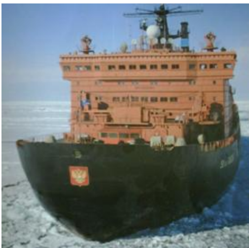
Figure 1: NS 50 Let Pobedy (50 Years of Victory).

In 1988, the Sevmorput , a fourth nuclear merchant ship, was commissioned in Russia (Figure 2). It is a lash barge carrier and container ship, 260 metres in length and fitted with an ice breaking bow. It has operated successfully on the Northern Sea route serving the Siberian ports and is powered by a KLT-40 135 MWt reactor similar to that used in the larger ice breakers. This propulsion system delivers 32.5 MW at the propeller and has required refuelling only once up to 2003.