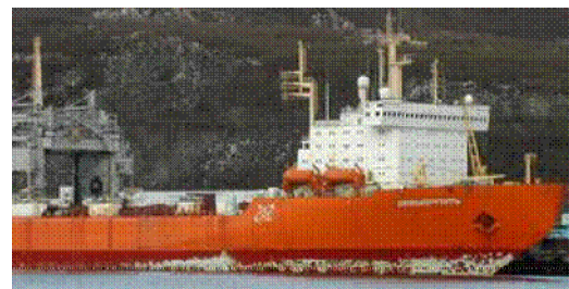
Figure 2: N.S. Sevmorput.

Continuing this development, two Taymyr Class shallow draught icebreakers of 18,260 dwt were launched in 1989 for use in estuarial waters. Looking to the future, a Russian 110 MW icebreaker is planned together with further dual-draught vessels delivering 60 MW at the propellers.