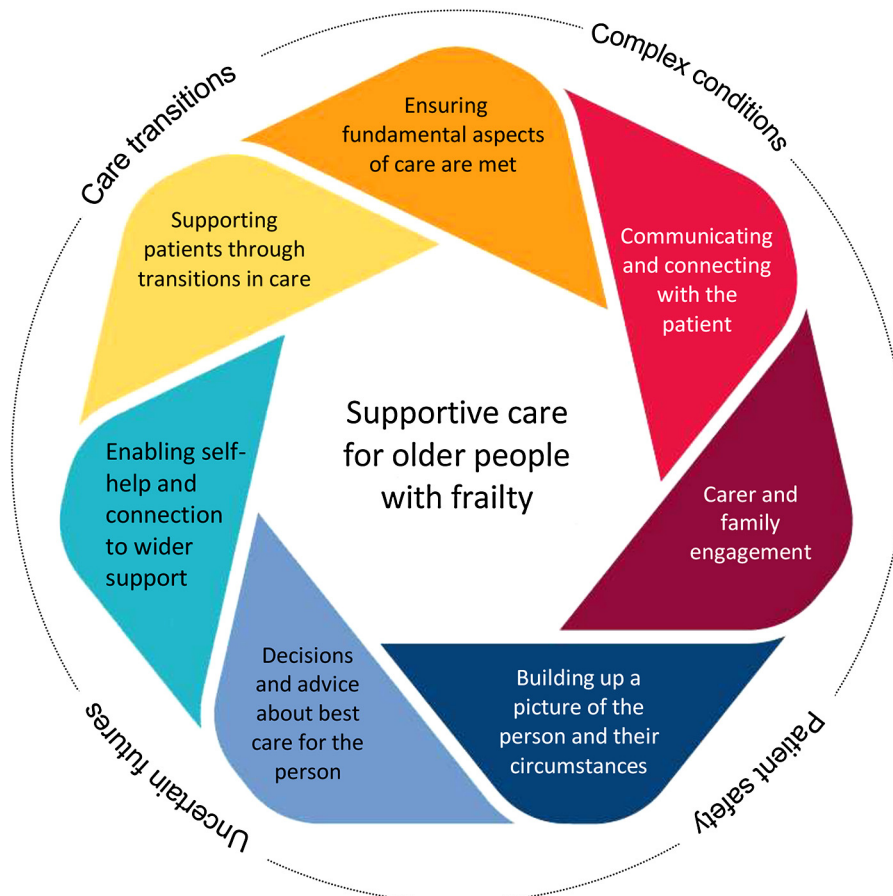
Fig. 2. Supportive care for older people with frailty.

Enabling self-help and connection to wider support relates to such terms and practices as – “self-management”, “rehabilitation/prevention”, “support groups/networks”, and “bereavement care” all of which involve situations in which patients, carers and families are supported by staff to access and build support for