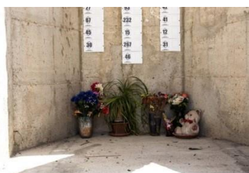
Photo 1, Cemetery in Sicily

Collecting ante-mortem data from families is one of the most challenging tasks, as it demands outreach to families of the missing, including potentially through cooperation