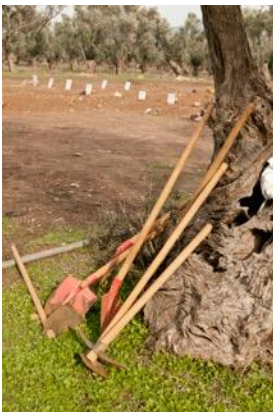
Photo 3 New cemetery in Kato Tritos

In Lesbos, there are currently there are two cemeteries on the island where victims of shipwrecks are being buried. Since the mid-2000s and particularly in the early-2010s when the Aegean in general and Lesbos in particular became the key entry point for refugees, the number of deadly shipwrecks increased and the vast majority of identified and unidentified victims were buried in the cemetery of Aghios Panteleimon . Their bodies are lightly covered by earth with only a piece of broken marble on the grave, which indicates a date (of the shipwreck or burial) and a number (for victims of particular shipwreck) (see photo 2). Due to the lack of a specific policy or an authority to lead the process, each burial tells a different story and largely reflects the struggle between the families, local NGOs the willingness of local authorities to assist, and the availability of funding.