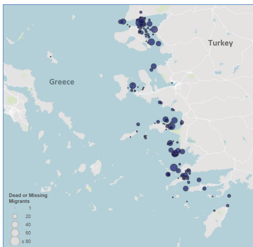
Map 1 Dead or Missing Migrants in the Eastern Mediterranean, 2014-2016.

Authorities in the countries of reception (most notably Italy and Greece) have been unprepared to deal with the nature and volume of this unprecedented humanitarian crisis. Currently, there is a policy vacuum around the problem, marked by minimal cooperation among different state agencies, an absence of any effective investigation, and little effort to contact the families of the missing. This results in bodies being buried with little knowledge of religious and cultural expectations or the rights of the families of the dead.