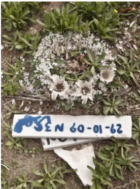
Photo 2 Cemetery of Aghios Panteleimon

In Italy, interviews suggested that centralisation of the data and liaison with families would be an important improvement for identification work. Primary identifiers such as tissue samples are routinely taken from all bodies and stored in different locations depending on the institution carrying out the examination. In most cases not under the aegis of the Commissioner's office 20 , data are stored at the institutions involved in the investigation, namely the RIS (Investigative Science Department of the Carabinieri), the Regional Cabinet of the Forensic Science Department, the Forensic Medicine Divisions at the universities involved, the Forensic Science Department, or the Labanof institute in Milano. As such, the