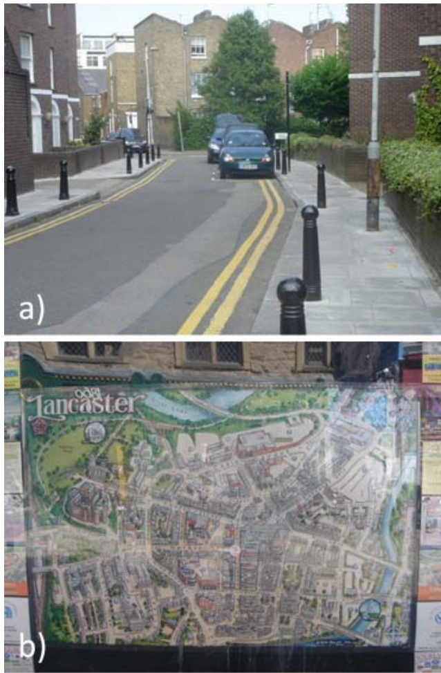
FIGURE 1. Examples of photographs used in this experiment. In (a), participants were asked to find the name of the street, and in (b), participants were asked to find the castle. (Images were displayed at higher resolution than shown here.)

from Eyelink II, were considered to be secondary outcome measures. For each participant, a median value was calculated across the 15 trials to estimate average saccades per second, average saccadic amplitude, and average fixation duration.