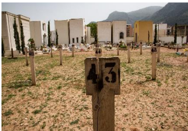
Photo 1 Grave of an unidentified victim of the 18th of April 2015 shipwreck. Castellammare del Golfo, Sicily.

The report is based on 27 semi-structured interviews with representatives from local and national authorities, civil society organisations and individuals. Some key challenges faced by the actors involved in the investigation of migrant deaths have been identified. One of these challenges is the complex nature of the problem. Migrant fatalities represent a complex humanitarian issue that requires an ongoing and coherent response, coordinated among the actors involved. They are a transnational phenomenon and as such there is a need to liaise with a range of actors in different countries. Families of the missing and dead in countries of origin and other European states or elsewhere have to be contacted in order to facilitate identification, as well as to ensure that affected families are at the centre of efforts to address the issue. Similarly, cooperation with consular or diplomatic authorities, international organisations and diaspora communities in third countries are needed to make contact with families.