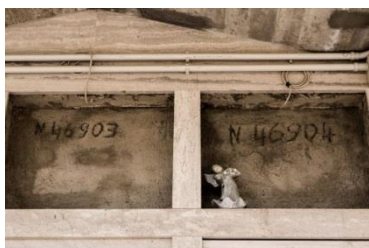
Photo 3 Graves of two migrants who lost their lives on 19 th of August 2006. Piano Gatta cemetery, Agrigento, Sicily.

The problems are technical-operational. But the answer of the Judiciary Police and Forensic Science Department is very up-to-date and fast, the post-mortem examinations are done, autopsies are done. It's the channel of information that should be facilitated mostly. But this depends on the existing relations with these countries. The more channels are opened with these countries, the bigger the channel of information gets and it's easy also for inspectors identifying the victim. (IT#24).