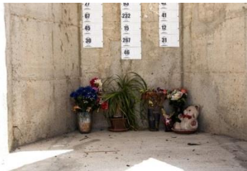
Photo 2 Piano Gatta cemetery, Agrigento, Sicily.

The thing is that there is no real division of roles. We [the Police] and the Carabinieri are Judiciary Police officers and work on investigating and reporting crimes, coordinated by the Public Prosecutor's office. Then, luckily, in Italy there's a (silent) kind of division of duties. So Carabinieri are a police force with a general competence, just like us, but, for example, in the branch of immigration in practical terms we are alone as regards the management of residence permits, photographic documentation for identification purposes and the management of immigration flows. (IT#24).