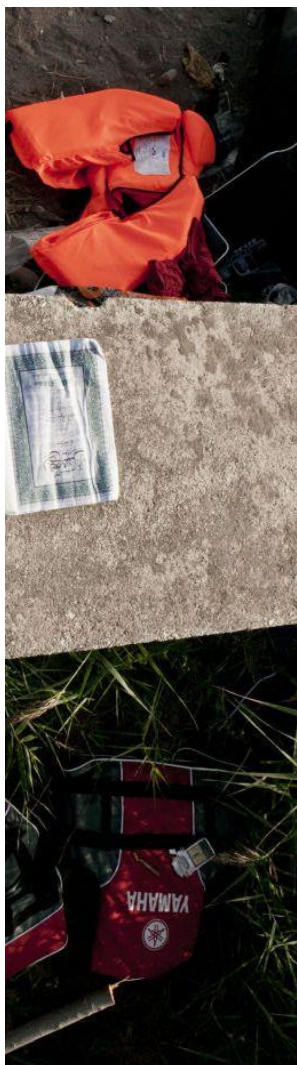
Photo 2 Belongings and documents found on the shores of Lesbos