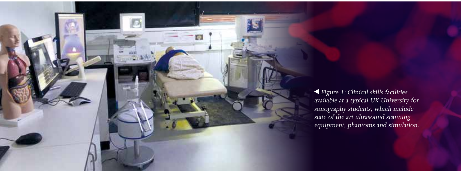
◀ Figure 1: Clinical skills facilities available at a typical UK University for sonography students, which include state of the art ultrasound scanning equipment, phantoms and simulation.

No other country relies so heavily on sonographers. Throughout mainland Europe, physicians and general practitioners perform a significant proportion of ultrasound examinations, having undergone very variable levels of training in ultrasound. Alternatively, sonographers may perform the scans but reporting remains the domain of the overseeing medical staff. For example, in countries such as Australia, Canada and the United States, ultrasound might be performed by sonographers but there is little evidence of independent reporting. However, the escalating need for ultrasound services is now causing some teams, particularly from Australia and some mainland European countries, to start focusing their attention on the UK model as a possible solution to meet demand.