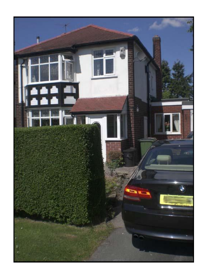
Fig. 2. Undesirable burglary target

The cues read by Ryan in these two properties provide a useful starting point to begin to unravel the in situ cognitive processing of residential burglars. 'Affluent Area' provided numerous signifiers that there were ample rewards on offer, which was of particular