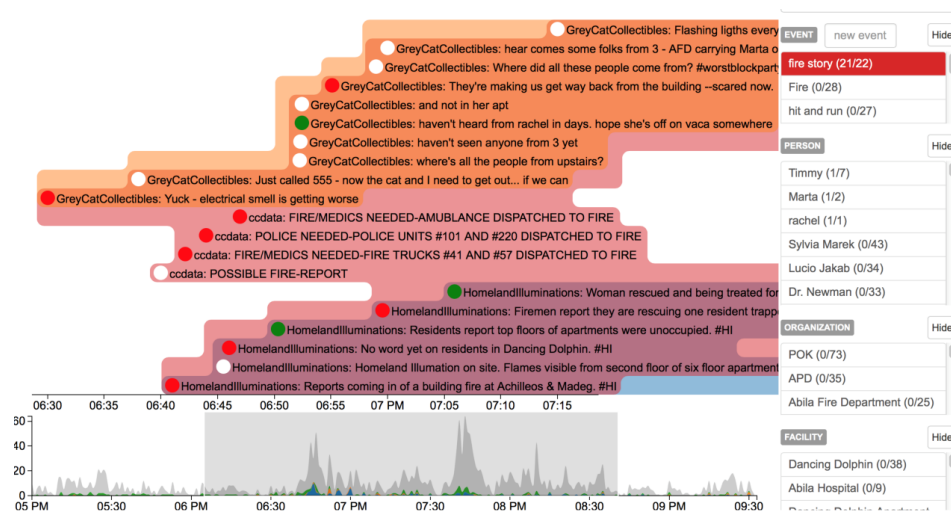
Figure 1: The timeline view in the Social Analytics Visualisation (SAVI). The messages (top-left part) are grouped according to their topics, indicating by background color. The histogram at the bottom and the entity list on the right can be used to filter the messages displayed by time interval and entity instance such as person and organization respectively.