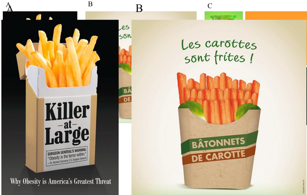
Figure 3. Visual Metaphors in the target domain of healthy food behavior

Notes: a. The poster for the film "Killer at Large" (with permission of Steven GreenStreet). b. The "Carrots are French fries" campaign to entice kids in French schools to eat healthy food (courtesy of Classe 35 agency, Marseille, France).