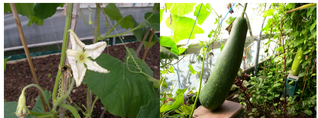
Figure 4. The seed library provides the seeds, images, and advice on how to hand pollinate the kudu flower at night.

The visions of the global food industry are typically abstracted and alienated from the lives on which our food depends – typically a devalued migrant labour force, and other species – as well as the soil in which it is grown, and the contingencies of climate. Designing for care asks us to pay attention to marginalised labour practices and the bodies that perform them. For example, the seed library makes available the seeds of the kudu plant along with the expert knowledge required to grow it successfully in London (see Figure 4). Lutfun, a seed guardian, tells you how, in Bangladesh, the flower is pollinated by a moth at night. In London, the kudu plant must be hand-pollinated in the evening when the male flower is open. Without this knowledge or work the kudu won't produce any gourds nor seeds, so the presence of seeds in the library signifies that this labour has been performed successfully. By sharing the seeds along with the " expertise of the migrant community " (Richard, seed guardian) to ensure the proliferation of community growing practices, the seed library participates in spatial autogestion by restructuring power relations, and making evident the embodied, specific and situated practices of care and labour that are required for multispecies flourishing in hybrid digital-physical space.