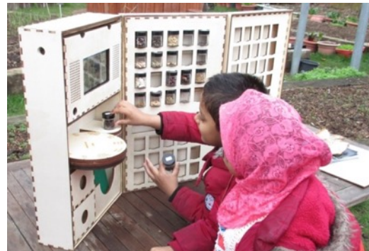
Figure 3. Engaging with the Connected Seeds Library

The interactive elements are built from a Raspberry Pi and screen, an RFID reader, a battery, and a speaker. The seed jars are tagged with RFID tags that link to their digital records. Visitors can join the library for free, take seeds home, and bring some back at the end of the season to maintain the living stock. The seeds also come in packets with QR codes that link to webpages with the digital content. The Connected Seeds Library is a new addition for the community from the project and continues to be used as a local resource at its permanent home at the farm.