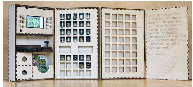
Figure 2. Connected Seeds Library

particular seed (Where these seeds came from; How I grow them; Tips and tricks; Recipes; How to save the seeds).