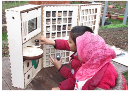
Figure 2: Children interacting with the seed library.

that link to webpages with the digital content. The Connected Seed Library continues to be used as a community resource at its permanent home at Spitalfields Farm.