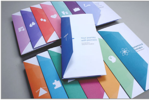
Fig 1. Pso Well® patient materials design.

and (ii) ‘Having a healthy lifestyle can improve my psoriasis or psoriasis flares’.