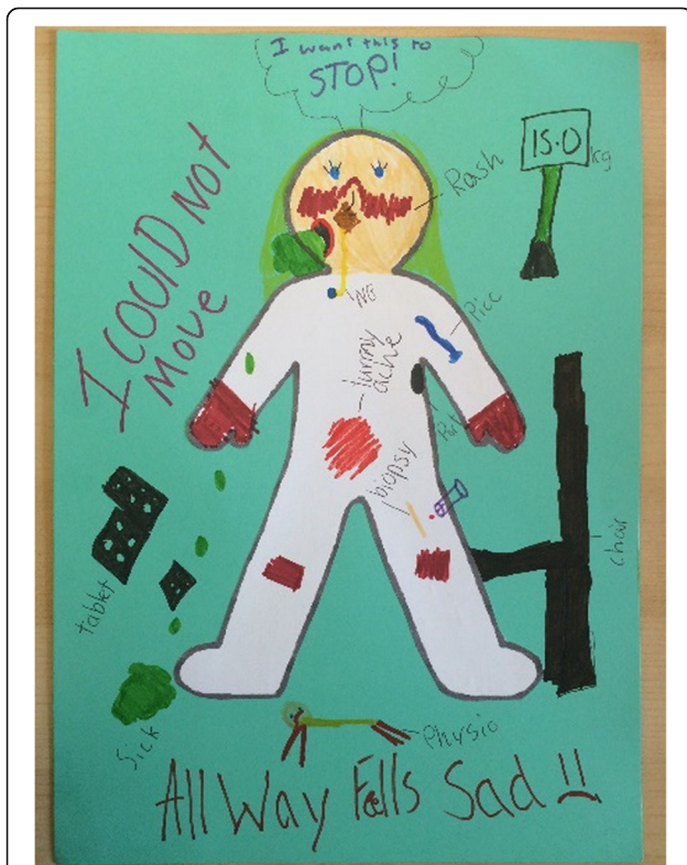
Fig. 1 A drawing representing participant's experience of Juvenile Dermatomyositis. Children and young people were given the option of drawing how they view the effects of Juvenile Dermatomyositis on their body, either as part of the interview (a warm up activity) or if they did not want to talk, instead of the 'standard interview'. They were offered a blank 'bodymap' and encouraged to complete however they wanted to, whether in text or drawing. The young person who completed this example, explained that they were drawing: the rash on the hands and face and knees, the biopsy site, the intravenous line in situ, constant tummy ache, vomit due to the medicines, tablet packets, scales (as they had lost so much weight) and a chair which they required as they couldn't stand. They went on to write on their picture "I could not move", "Always feel sad" and a thought bubble showing "I want this to STOP"

The aim of interpretive phenomenology is to describe, understand and interpret experience from those experiencing it [17, 19, 31], achieved through a circular continuous process of reading, writing and talking [32]. A method proposed to derive narratives from transcripts [33] was modified into clear steps (Table 1). This process begins with the reading and re-reading of the transcripts, before removing repetition and superfluous text. As the