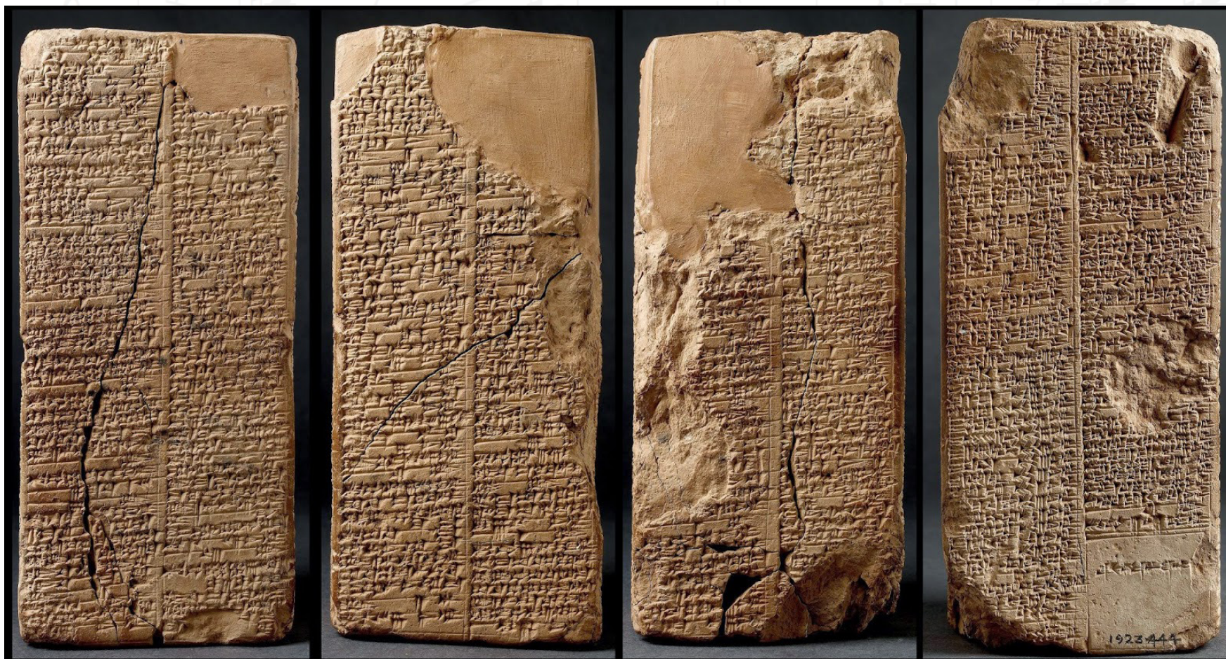
part of the Enûma Eliš

The title, meaning “when on high”, is the incipit. The first tablet begins: