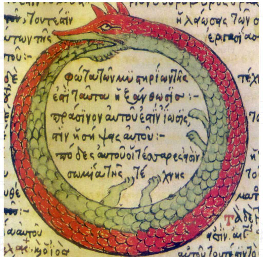
the Ouroboros, in a 15th century drawing by Theodoros Pelecanos

Here, the pitch material and rhythmic cells continually re-create to reveal ever changing combinations, expressed through tempi changes, octave displacements and textural contrasts between staccato, legato, and phrased and sustained sounds.