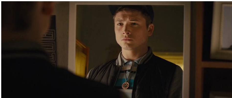
Figure 28.2. Eggy’s Transformation from “Chav” to Chap. Screen captures from Kingsman: The Secret Service (2014), 20 th Century Fox.

Eggsy: Because my mum went mental. Banging on about losing me as well as my dad. Didn't want me being cannon fodder for snobs like you. Judging people like me from your ivory towers with no thought about why we do what we do. We ain’t got much choice. You get me? And if we were born with the same silver spoon up our arses we’d do just as well as you, if not better.