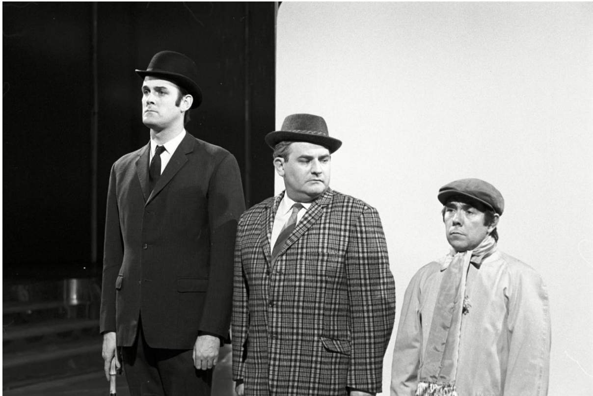
Fig. 28.1. Frost on Sunday, “The Class Sketch” with John Cleese (Upper), Ronnie Barker (Middle) and Ronnie Corbett (Lower). c. 1970.

Barker: I look up to him [Cleese] because he is upper class, but I look down on him [Corbett] because he is lower class. I am middle class.