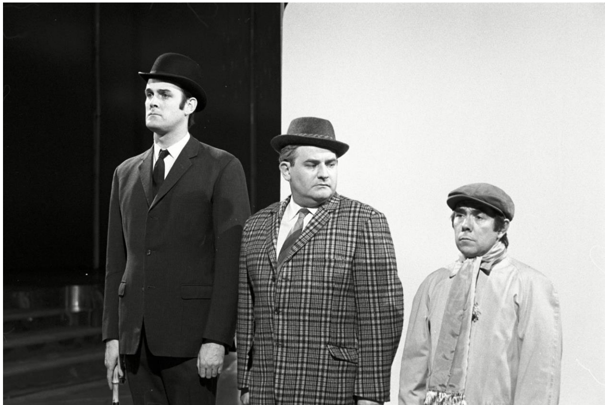
Fig. 28.1. Frost on Sunday, “The Class Sketch” with John Cleese (Upper), Ronnie Barker (Middle) and Ronnie Corbett (Lower). c. 1970.

Barker: I look up to him [Cleese] because he is upper class, but I look down on him [Corbett] because he is lower class. I am middle class.