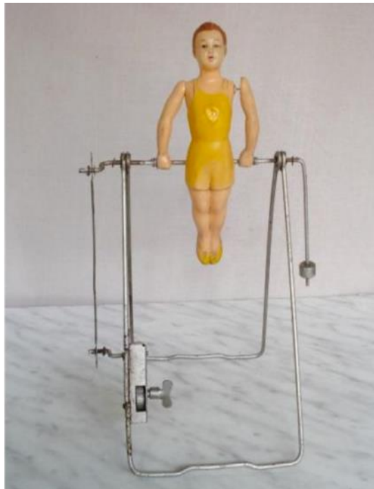
Image Description: Between two thin steel A-shaped frames – with another thin steel bar between them (resembling a swing set) hangs a white, plastic, male figure. A small mechanical winder is attached to the bottom of one of the A-shaped frames. When wound, the figure spins around the bar like a gymnast.

Figure 5. Antique USSR Child Mechanic Celluloid Toy Gymnast, circa 1950s.