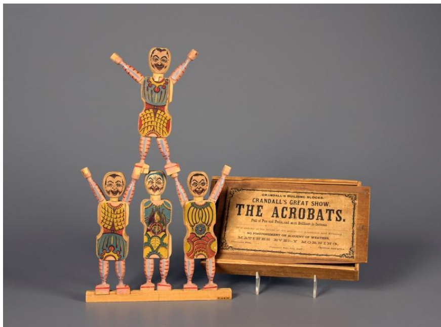
Image Description: Four small wooden figurines stacked on top of each other, three figures on the bottom row and one on the top row, much like a cheerleading pyramid. Beside the pyramid of figurines is a wood box where they are stored with the text, "Crandell's Building Blocks. Crandell's Great Show, THE ACROBATS. Full of Fun and Frolic, and Most Brilliant in Costume. Will exhibit at the house of the purchaser Afternoon and Evening. NO POSTPONEMENT ON ACCOUNT OF WEATHER MATINEE EVERY MORNING. Admission Free, Children Half-Price."

Figure 2. Crandall's The Acrobats, circa 1867. (Hogan, 2011).