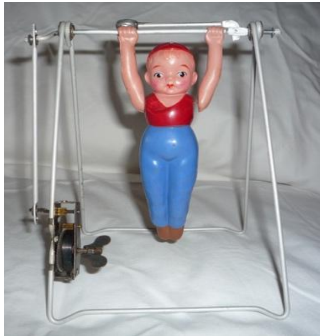
Figure 1. The Toy Gymnast, circa 1940s.

What follows is a detailed description we developed of the Toy Gymnast: