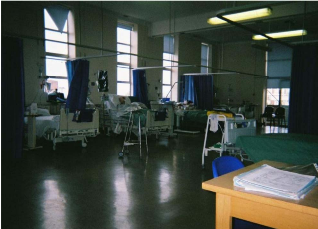
Fig. 3. Surgical ward pre-move.

The examples above illustrate how communication that aims to ensure the needs of patients are met is enabled by a space that allows wide-angle visibility and easy transfer of sound/voice. This corresponds to what Pallasmaa describes as ‘peripheral’, or context-rich, vision in his study of architectural forms (Pallasmaa, 2012). Fig. 3 provides a sense of the view nursing staff had of inpatient beds in the open-plan surgical ward of the old hospital building. The nurse who took this photograph (Fig. 3) said she could sit at the desk (particularly on night duty) and could see all 8–10 patients including those out of this particular shot. By contrast, Fig. 4 illustrates the single room corridor in the new building, with in-board bathrooms highlighting staff’s inability to see and thus check on more than one patient at a time