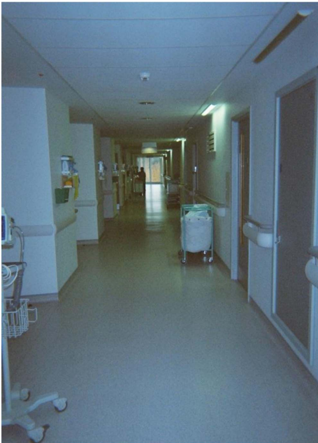
Fig. 4. Surgical ward, post-move.

The examples above illustrate how communication that aims to ensure the needs of patients are met is enabled by a space that allows wide-angle visibility and easy transfer of sound/voice. This corresponds to what Pallasmaa describes as ‘peripheral’, or context-rich, vision in his study of architectural forms (Pallasmaa, 2012). Fig. 3 provides a sense of the view nursing staff had of inpatient beds in the open-plan surgical ward of the old hospital building. The nurse who took this photograph (Fig. 3) said she could sit at the desk (particularly on night duty) and could see all 8–10 patients including those out of this particular shot. By contrast, Fig. 4 illustrates the single room corridor in the new building, with in-board bathrooms highlighting staff’s inability to see and thus check on more than one patient at a time