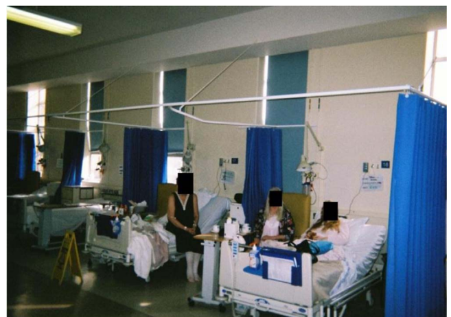
Fig. 5. Surgical ward, pre-move.

The physical barriers to socialisation for patients in the new hospital meant reduced opportunities for patients to help and support each other when staff were not immediately available. Following the move to the new hospital building, a nurse from the surgical ward commented: