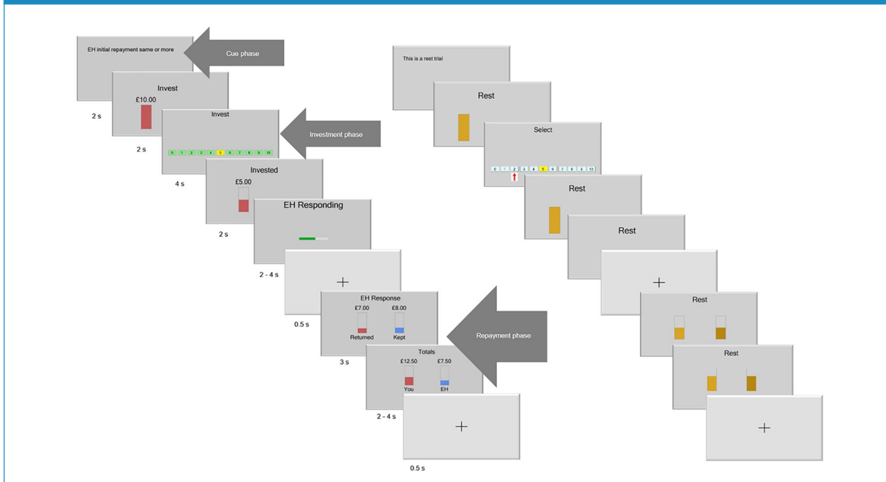
Figure 1. Left: investment trial with positive context (1) context cue: ‘initial repayment same or more’, (2) investment cue, (3) investment choice, made by scrolling over a horizontal bar ranging from £0 to £10, which started at £5, (4) invested amount displayed, (5) wait for game partners’ response (jittered), (6) fixation cross, (7) returned amount displayed, (8) round totals (kept and given amount added) for both players (jittered) and (9) fixation cross. Right: control trial, similar to the experimental trials, except for (a) ‘Invest’ was replaced by ‘Rest’ and (b) in the investment phase, participants had to move the cursor to the marked number.

mixed effects multilevel random regression analyses (MIXED) to account for repeated measurements within persons, with (first) investment as dependent variables and with group (control and patient) and context (negative, no and positive) and their respective interactions as independent variables. For investments over trials, trial number (1–20) was added to the model. Mixed effects multilevel random regression analyses (MIXED) were used to examine associations between investments and ESM indices of real-life social functioning (% alone, social exclusion and quality of social relationships) across contexts. Interactions were probed with the CONTRAST command. Analyses with a significant group effect are additionally reported with estimated IQ as a covariate. Additional analyses on association with symptoms are reported in Supplement – E.