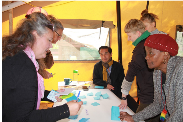
Figure 1 (left): Participants in workshop 1 mapping more-than-human stakeholders in the city farm