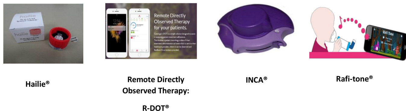
Figure 1 Novel Electronic Monitoring Devices used in the study INCA, inhaler compliance assessment; R-DOT, remote directly observed therapy.

Written, informed consent was obtained from the parent/carer, and CNS', and consent or age appropriate assent from the child.