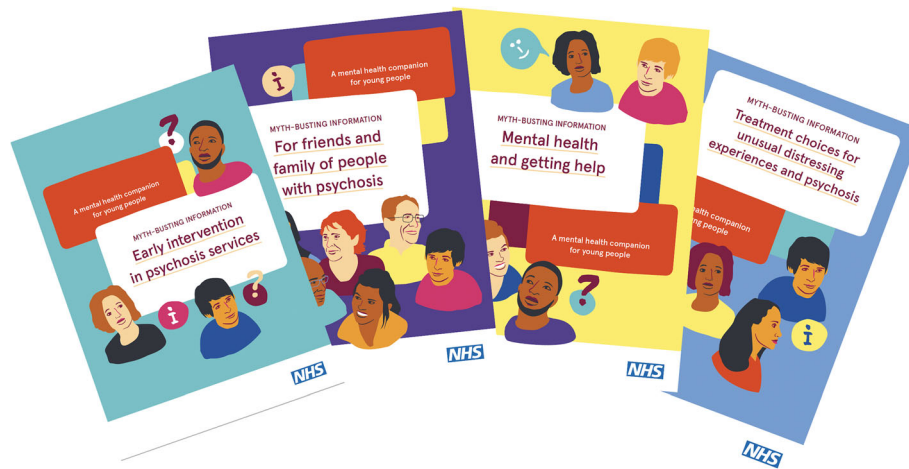
Fig. 2 EYE-2 intervention booklets for service users

Staff and service users are encouraged to draw on a wide social network of friends, family and peers, in pursuit of the young person's goals, supported by the friends and family booklet and service user-led social groups run by the PPI lead, and RA, that focus on young people's own goals and interests and encourage young people to support each other. Training is provided in carers' rights, and in processes for involving friends and family.