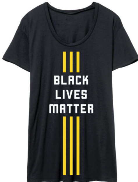
Figure 1. Black Lives Matter 2020 protests.

Both applications have been opposed by the BLMGN. The BLMGN argues that the applications should be rejected. They argue: (1) that granting the trade marks would deceive the public about the origin of the goods, (2) that the applications were made in bad faith, and (3) that it is against public policy or morality to allow someone not associated with the Black Lives Matter movement to register a trade mark on these terms. The BLMGN alleges that these trade marks should be granted to them. They have subsequently applied to trade mark both "Black Lives Matter" and "I Can't Breathe" in relation to clothing. For some significant period of time, the BLMGN has been selling t-shirts on their website containing the phrase "Black Lives Matter" (see Figure 1 ). They have substantial market research demonstrating that the average consumer associates such t-shirts with the BLMGN. However, they have not previously used the "I Can't Breathe" slogan and have no market evidence concerning the consumer perception of such mark.