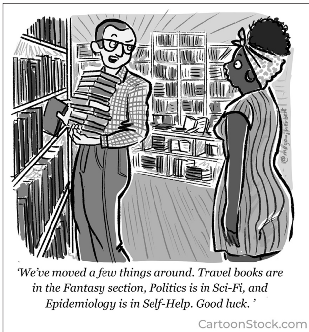
Figure 1: "We've moved a few things around...".

When I finally got back to Australia, in July of 2020, we did our quarantine in Sydney and then got back into my little house which I'd been renting out here in the Mornington Peninsula and I was very happy to be back in it, but all of a sudden, I thought, oh no! I've arrived in the middle of a pandemic, I need to very quickly start earning money and get out there and also re-establish all my contacts. I was doing that in so many different ways, but I knew that I wanted to do more cartooning. I thought, okay I'm going to