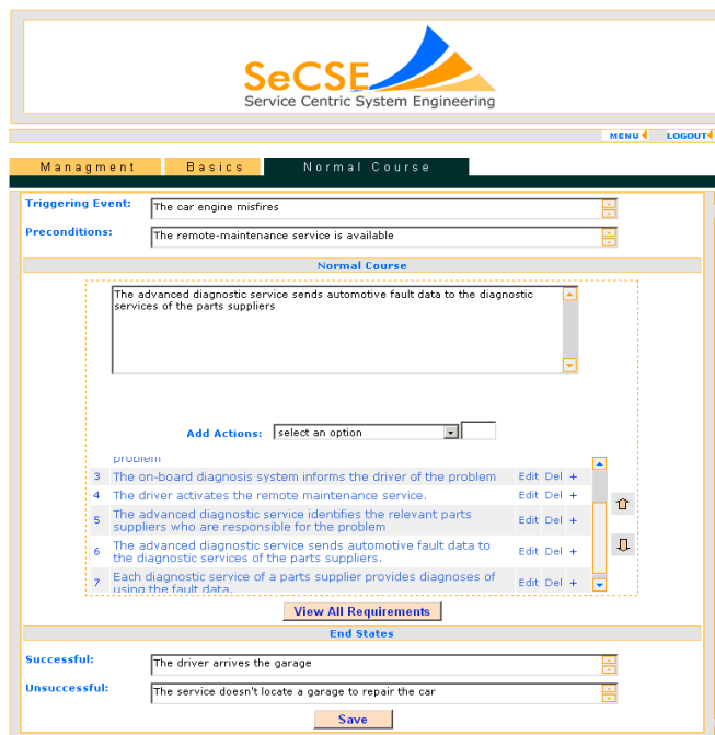
Figure 9. The use case specification modeled in the SeCSE environment.

As in the previous iteration, the service integrator can create a query to discover candidate services for one function of the system using the action description and the requirements associated with that action – that is the bolded text in Figure 8. Retrieved service descriptions can again be used to refine that part of the use case specification, and in particular refine and trade-off the satisfaction of non-functional requirements that cannot be complied with fully from the available services.