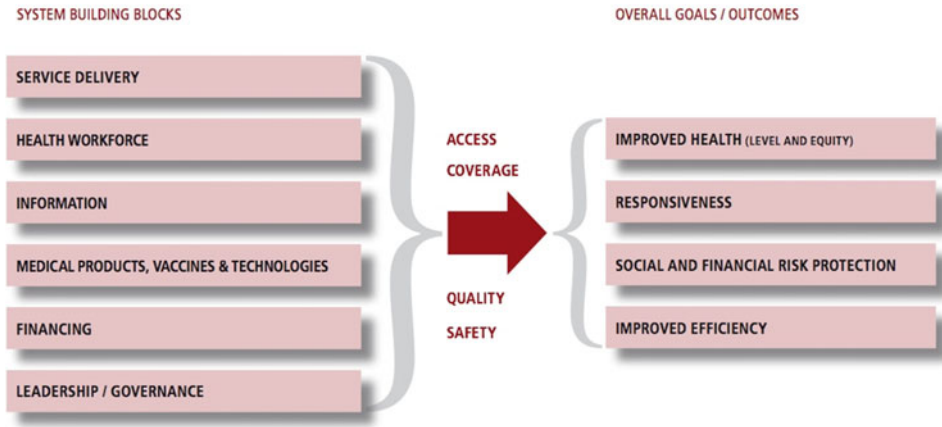
Figure 1. WHO health system framework.

interpretation of legal texts, we evaluate what the TCA, the WA and the provisions of the CTA mean for the NHS and social care across the UK. We draw on documentary data in the public domain, 23 semi-structured interviews and two online workshops, carried out under two related research projects, from February 2019 to December 2020. Ethical approval was given by the University of Sheffield (Reference 022929) and the University of Oxford (Reference R72072/RE001) (Figure 1).