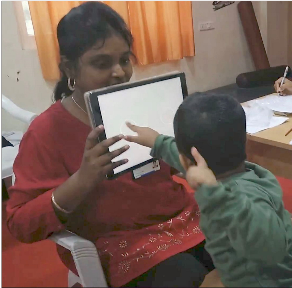
Figure 1 Grating acuity testing using Peekaboo Vision application.

was also carried out that included history taking, refraction, assessing accommodative status, anterior segment evaluation and undilated fundus evaluation (these results have not been included, as they are beyond the scope of this paper). Those children who were likely to benefit from a dilated/cycloplegic examination were referred to pediatric ophthalmologists in a tertiary eye care institute. Retest was attempted on children with Down syndrome and on controls within an average duration of 2.5 months. Verbal feedback about the child's engagement with Peekaboo Vision application was obtained from the parents.