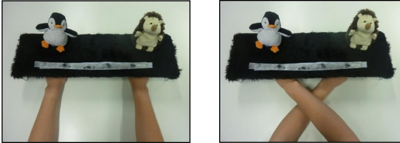
Figure 1: example of seen, uncrossed condition set-up (left hand side) and seen, crossed condition set-up (right hand side) from the participant's point of view. In the unseen conditions, a black cloth of the same faux fur fabric covered the participants' arms.