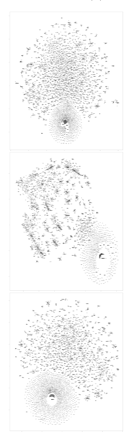
Figure 1: Visual representation of word vector spaces. Figure in the upper section contains the visual representation of every token in the corpus. Figures in the middle and lower sections contain the visual representation of the tokens in the legitimate and disinformation subsets of the dataset respectively.