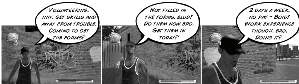
Fig. 3 Screen shots and abbreviated snippets from the spoken dialogue in StreetWise demonstrate how a story path with a particular character may develop over 3 rounds depending on the choices the player makes and random seeding from the Scenario Engine.

The scenario engine introduced a level of randomness to each game by seeding from a bank of interweaving scenarios and attributing them to suitable characters. It also reacted to how well the player was doing by utilizing weighted scenarios to provide easier or harder gameplay [fig. 4] – choices that were previously rejected were