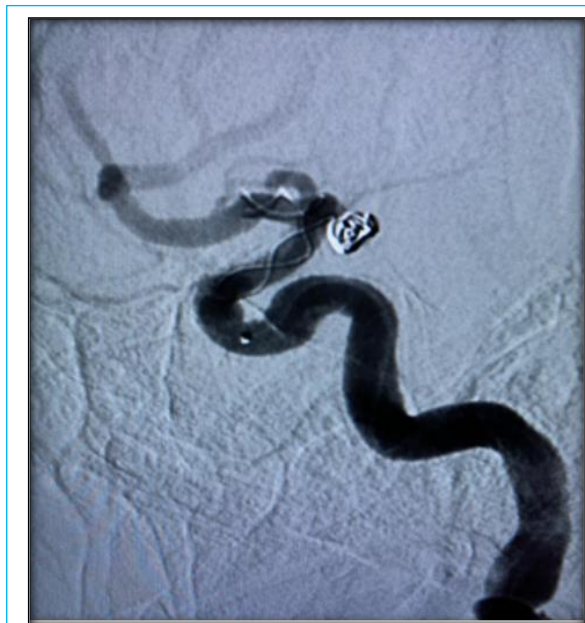
Plate 3: Digital subtraction angiography images demonstrating wide-neck saccular aneurysm of the posterior communicating artery post stent assisted coiling (x 2 magnification)