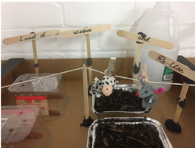
Figure 7: The land of wisdom and reuse built by Rose, a participant.

Our reflection and data from the previous workshop showed a lack of agency and control experienced by the participants that limited their expansive thinking. In the final workshop, we decided to develop a fictional scenario for a world-building task where the participants had to build a world in 3D using scrap material provided to them. The scenario was designed as an invitation letter, building on the positive experiences and skills of the community as experts in food growing. The letter was addressed to the community members from the British Interplanetary Society, intending to visit and build infrastructures conducive for growing in the new-found planet, Earth X. This gave the participants agency and material to build a new world from scratch, building their individual worlds while taking inspiration from one another see the worlds built by participants in Figures 7 and 8. The participants later described their idealized visions of the new world where most of them used technology. These ideal worlds were less ridden with trouble and conflict and were places for desires and wonders.