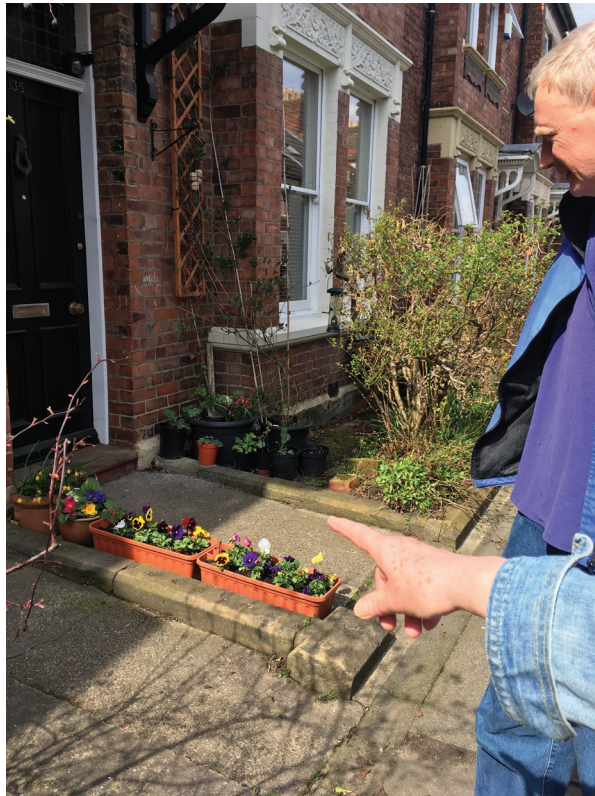
Figure 3: Participants on the walk, pointing at edible plants growing in the urban environment.

In the second workshop, we walked the neighbourhood as seen in Figures 3 and 4, with the participants, visiting locations discussed during the last workshop. The aim was to ask the participants to re-imagine the present through the fictional scenarios we provided at specific places where we stopped on the walk, for example, the contested back lanes. The fictional scenarios, both positive and negative, were developed through a desk survey of recent news articles, successful neighbourhood projects and topics. These scenarios were based on other successful community projects in the UK and we wanted to use them as material to inspire co-imagination. An example scenario reads, 'imagine if the neighbourhood won an award from Grow Your Own magazine for best innovative "green" food growing community? How do you think this could be achieved?'. All scenarios were mapped to specific locations in the neighbourhood based on discussions in Workshop 1. The participants discussed the scenarios, how they could achieve them and how these would impact the food growing and sharing in the neighbourhood. Thereby they exposed problems, conflicts and limitations faced by the community when growing food in the neighbourhood.