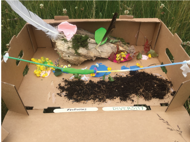
Figure 8: The land of festivities and biodiversity built by a researcher with the participants during the workshop.