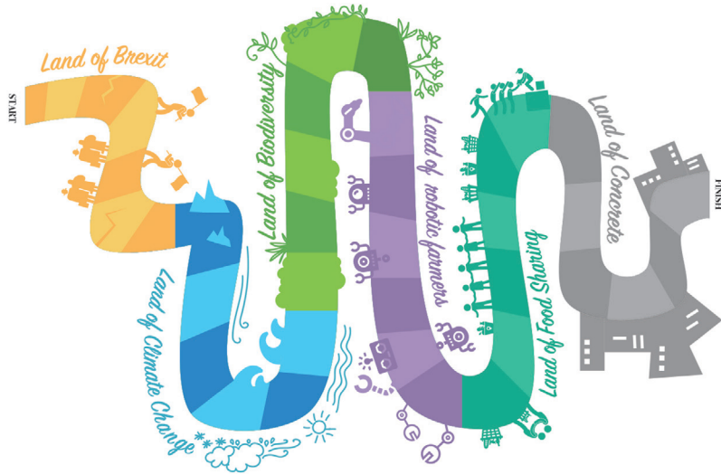
Figure 5: The future lands board game.