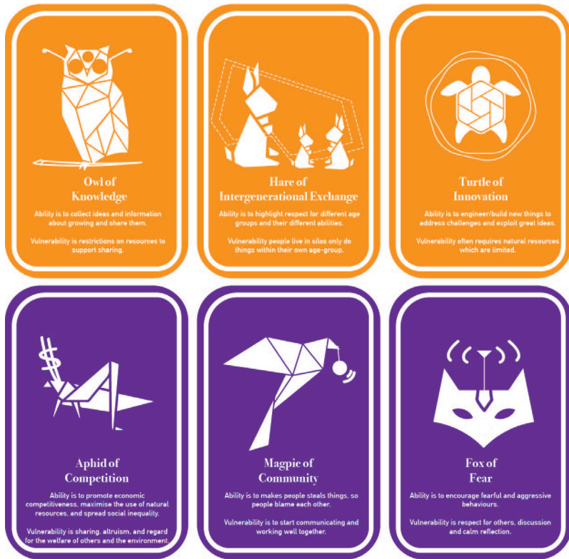
Figure 6: Beast of opportunity and beast of concern cards to accompany the game.