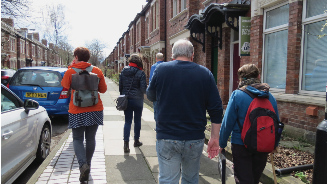
Figure 4: Participants during the walk.