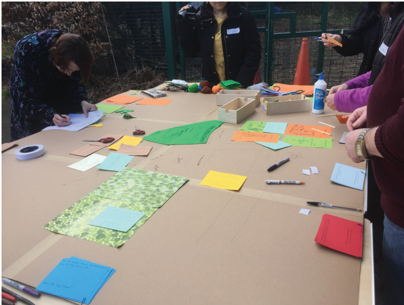
Figure 1: The participants populate the cardboard map with prompt cards.