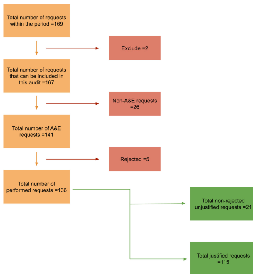
Figure 1. a Flow Chart to show the Patient Inclusion and Exclusion Process

excluded due to poor image quality resulting from uncooperative paediatric patient and lost record. Out of the remaining 141 requests, 4/141 forms were rejected correctly, and 1/141 was rejected incorrectly; 81.6% (115 requests) adhered to RCR guidelines. As the result, 136 requests in total (141 A&E requests – 5 rejected = 136) were ac-