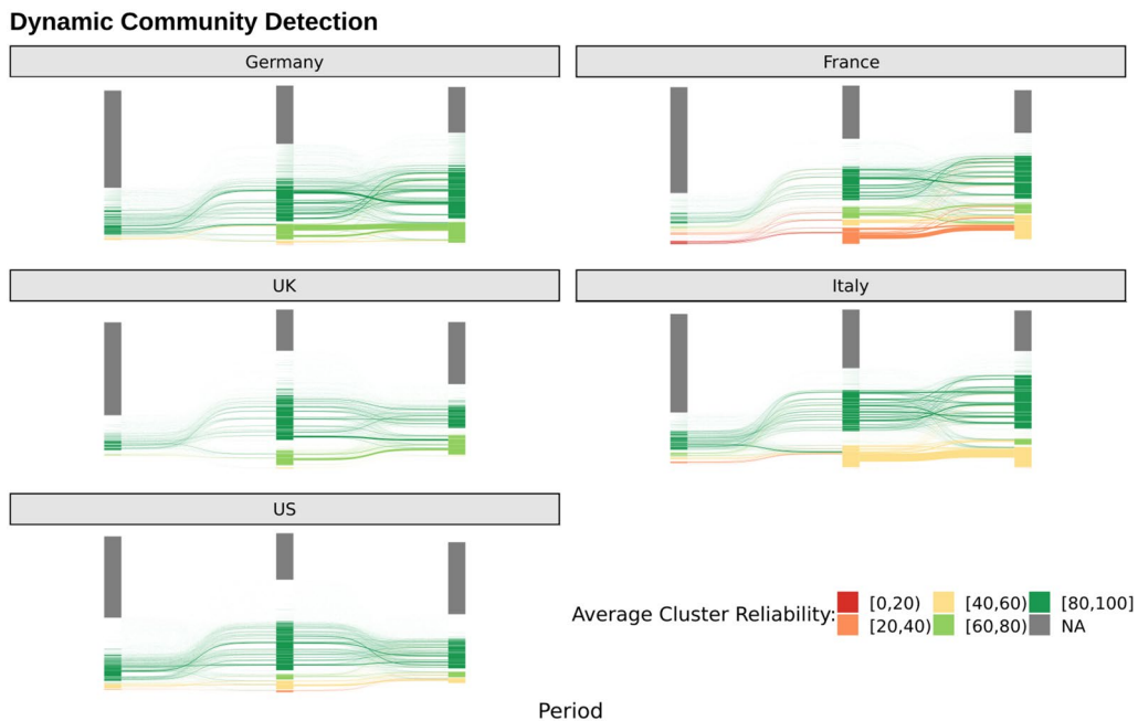
Fig. 4 Evolution of the communities in the interaction network over time. Communities are represented as lines and connections between communities represent accounts movement. Average community trust

\Delta Q ( \Delta R ) measures the shift in the volume of the average questionable (reliable) tweet production after an event compared to the level before the event, as measured by the model. The * indicates statistics employing non-statistically significant ( p value > 0.05) coefficients; i.e., there is not enough evidence in favor of a change in level after the event. The ratio \Delta Q/\Delta R measures the changes of questionable average tweet production with respect to the reliable one: numbers over 1 indicate that questionable tweets grew more than reliable tweets; conversely, numbers below 1 indicate that reliable grew more