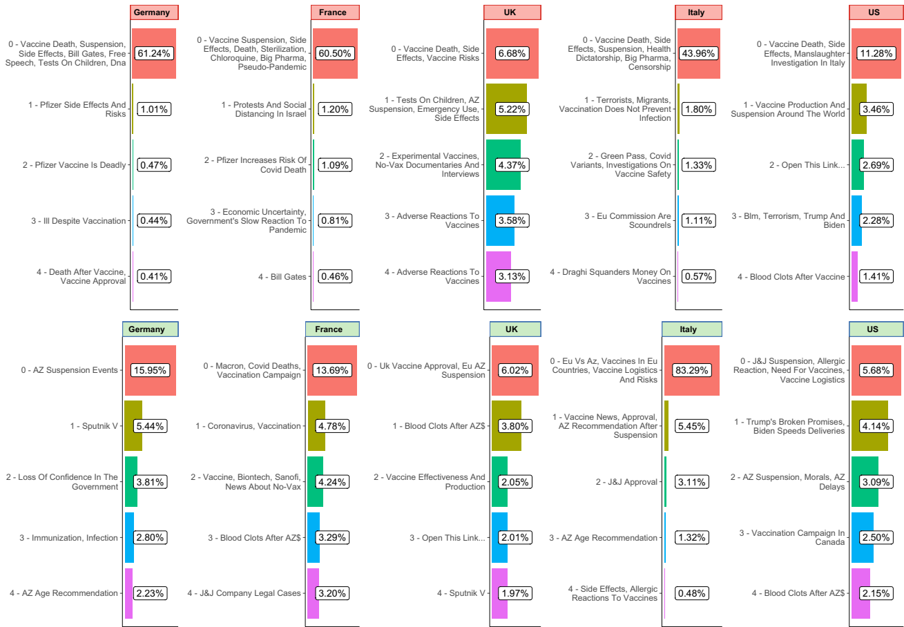
Fig. 2 Most debated topics by country. The five most frequent topics, identified through topic modeling, by country and reliability. Red (green) panels show topics in questionable (reliable) tweets. Lengths

of the bars represent the share of tweets belonging to each topic relative to the other four topics. The percentage indicates the share of tweets by country and reliability belonging to each topic