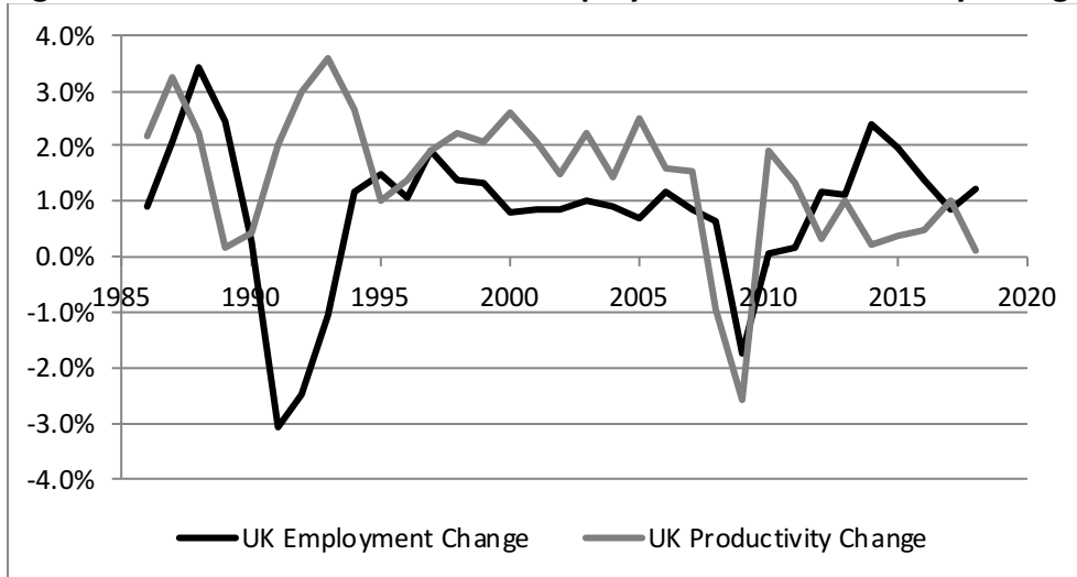
Figure 1: The Relation of UK Annual Employment and Productivity Changes 1985-2018

Source: ONS: The productivity index is a ratio of a chained volume series to total employment.