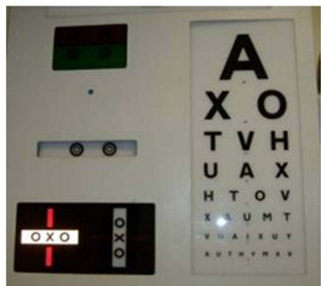
Figure 1. A picture of the distance Mallett Unit (bottom left rectangle).

All five hundred participants completed the study and their age ranged between 18 and 59 years (mean 41.63 years, standard deviation (SD) 11.86 years). All data was recorded with esophoric