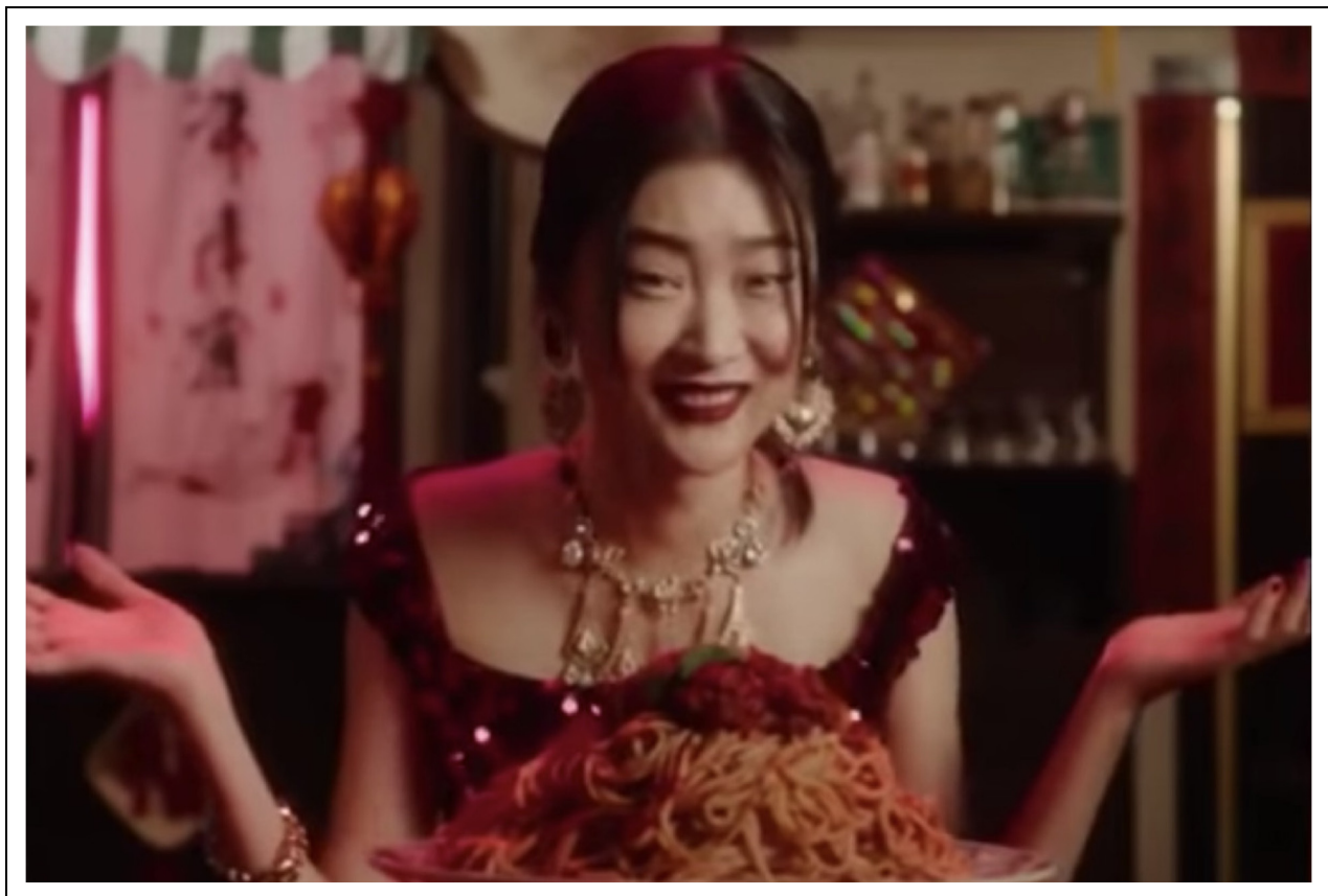
Figure 3. Dolce & Gabbana (D&G) advertisement for the Chinese market. Source: https://www.vox.com/the-goods/2018/11/21/18106473/dolce-gabbana-fashion-show-china-racism-instagram .

The founders of the company did release a contrite apology video outlining their respect for the Chinese nation, its history, traditions, and people; however, this was not well received by Chinese consumers, particularly considering the alleged comments attributed to the company co-founder. As a result, the brand has suffered significant damage in the crucial Chinese market for luxury goods (McEleny 2018). The advertisement attempted to employ humor as a device for the Chinese