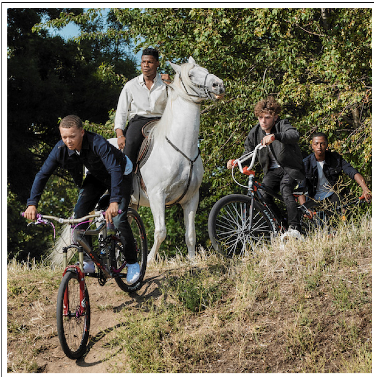
Figure 2. Jo Malone “London gent” advertisement featuring John Boyega. Source: https://perfumesociety.org/jo-malone-london-gent-film-first-look/ .