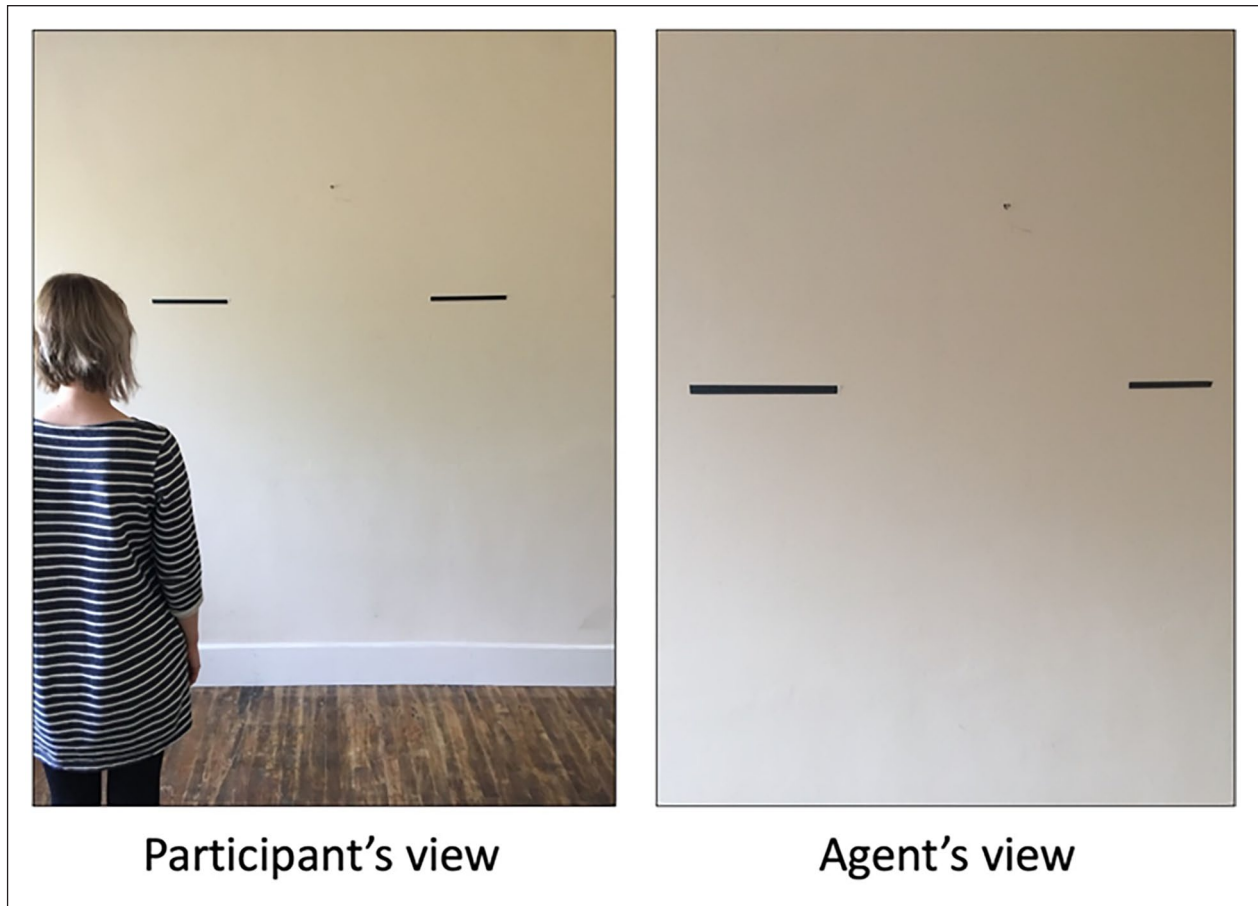
Figure 1. The agent view image was never shown to participants.

therefore be less likely to judge that the line furthest to the agent would appear visually longer to her.