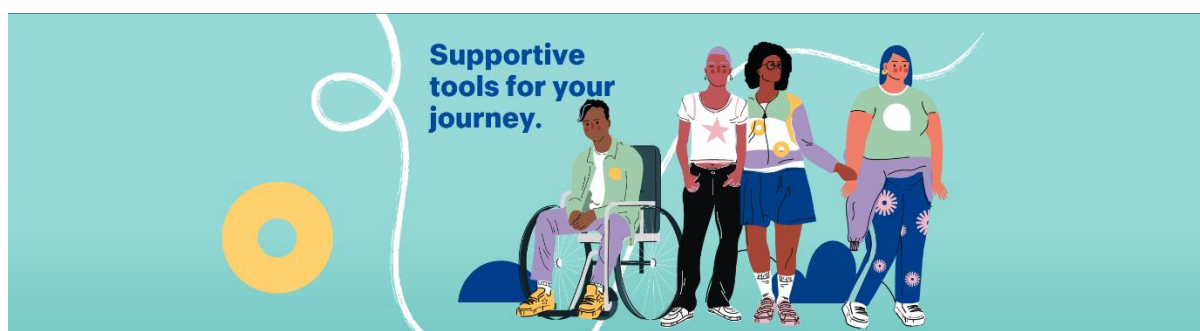
Figure 1. Image from Oneself's homepage