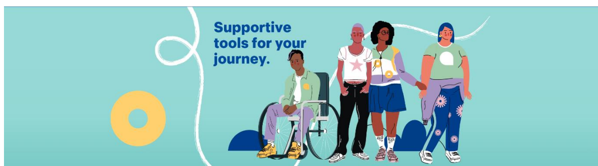
Figure 1. Image from Oneself's homepage