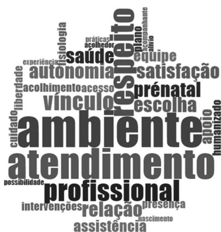
Figure 3. Word cloud showing the most frequent words in the studies describing women's experiences in freestanding birth centers.

Words (most to least cited): Environment; health care; professionals; respect; bond; choice; antenatal care; relationship; health; support; humanized; satisfaction; autonomy; assistance; team; presence; interventions; care; liberty; physiology; plan; childbirth; possibility; companion; practices; experience; welcoming; relief.