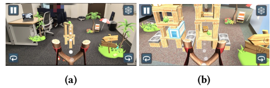
Figure 1: Player is holding the slingshot with a bird to shoot in (a) private setting, and (b) public setting. The white dots show projectile paths where the bird might land. Two UI elements (buttons) in the bottom with directional arrows indicating which way (left and right) it can rotate the structure.

3.1.1 Participants. We promoted our study by distributing flyers at a local college and sending emails to students and staffs. Interested people were directed to complete an online “Participant Registration” form (see Supplementary Materials, Section 1). We aimed