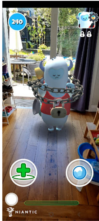
Fig. 1. AR character Yeti in shared AR Urban Legends .

a new form of public social play, aligns with or challenges existing understandings of social play dynamics.