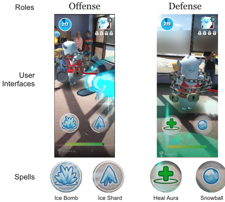
Fig. 4. UIs of offense and defense. Users can tap the round icons to launch spells. Each role has two spells. Screenshots from participants' screen recordings.