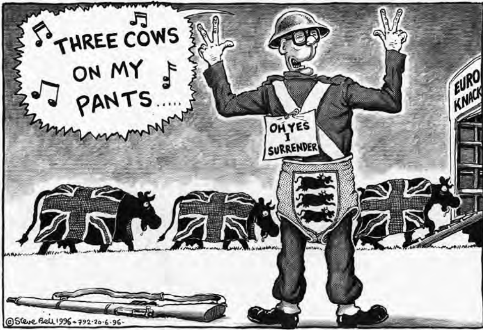
Figure 3.4 Three Cows on My Pants, 41 Steve Bell, Guardian, 20 June 1996.

The buttoned-up Britishness Major was perceived to represent was best exemplified by the phrase ‘back to basics’ which he coined in a speech in 1993 and which was an attempt to revitalize the government after the financial disaster of Black Wednesday. 42 ‘Back to basics’ was generally understood as a moral campaign