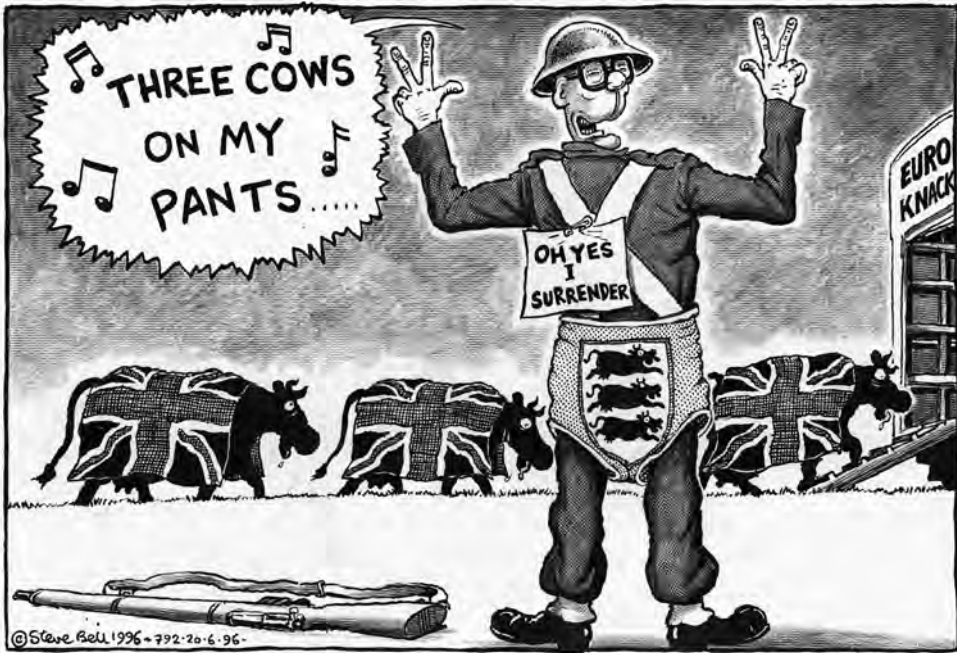
Figure 3.4 Three Cows on My Pants, 41 Steve Bell, Guardian, 20 June 1996.

The buttoned-up Britishness Major was perceived to represent was best exemplified by the phrase 'back to basics' which he coined in a speech in 1993 and which was an attempt to revitalize the government after the financial disaster of Black Wednesday. 42 'Back to basics' was generally understood as a moral campaign