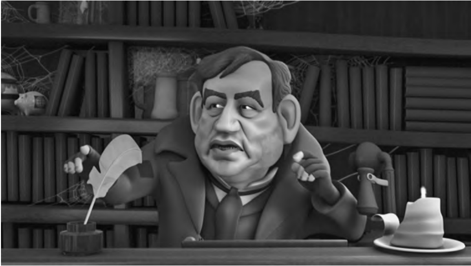
Figure 3.6 Gordon Brown as represented in Headcases (ITV)

of Brown have been consistently marked by attacks on his personality, focusing either on a lack of certainty in his decision-making or concentrating on his perceived sternness, ill-humour and gloominess. For example, the satirical animated television programme Headcases – in many ways the successor to Spitting Image – represents Brown as a modern-day version of Scrooge from Dickens's A Christmas Carol (Fig. 3.6). Instead of 'bah, humbug!' this may be the beginning of a political era that will be referred to a Dour Britannia. 66