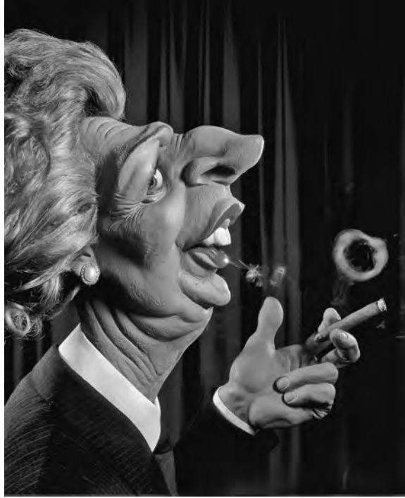
Figure 3.2 Margaret Thatcher: the Spitting Image representation © Courtesy of Spitting Image Workshop, John Lawrence Jones

The most striking aspect of Myers's manuscript score is that there are significant differences between it and the recorded broadcast version. As far as can be ascertained, this is the only manuscript source in existence (Fig. 3.3). 37 The score is written in Myers's own hand and represents his orchestration, rather than that undertaken by an orchestrator from a sketch. Although they appear in the score, there is no string orchestra, bassoon, flute or harp countermelody, or cadential use of the horn in the broadcast version. The hi-hat plays a steady crotchet pattern and not the semiquaver pattern as it is notated. Furthermore, the entire B section of the ternary form score is not used for the broadcast version. 38 In short, Myers's broadcast music is a significantly pared-down version of the musical material contained within the score.