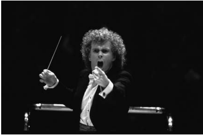
Figure 3 Simon Rattle.

In other images, however, the self-evident corporality of the conductor demonstrates something of the strenuous demands placed upon him as he dances. While the English word ‘dancing’ will for many bring with it associations of light-hearted pleasure, the conductor’s execution of his task may lead to facial expressions and postures that could be read as conveying quite different meanings (see Figures 3–5). These images, ostensibly of passion perhaps but equally valid if taken as grimaces of pain, suggest the physical discomfort experienced by the shaman as he plays out the musical tensions that he takes symbolically into his body. The sweating brow and tousled hair remind us that this is hard physical work,