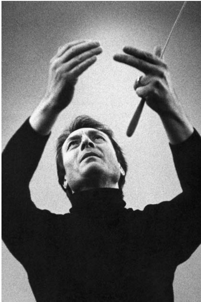
Figure 6 Carlo Maria Giulini

Of all those participating in the event it is this presiding figure who is most keenly aware of its solemnity and quasi-religious significance. Like other shamans, not only do conductors rely on music and dance for the efficacy of their performance, they must also occasionally offer what may seem like prayers, or at least supplication, to the musical spirits they entertain (see Figure 6). Through such gestures the conductor marks out the sanctity of the event, affirming the creation of a ritual space wherein communication with the musical spirits may be established. And as Rouget observes, dance is 'above all, communication – with oneself and with others'. 69