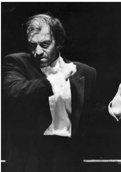
Figure 4 Valery Gergiev