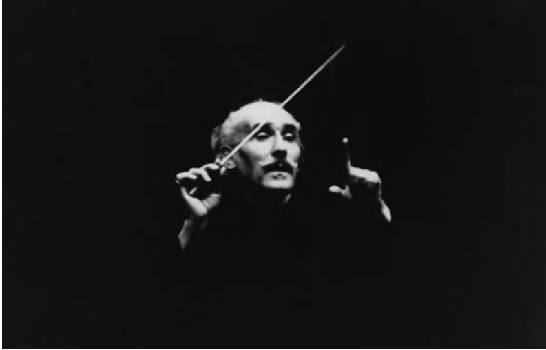
Figure 1 Arturo Toscanini.

In some of these images it is as if the conductors themselves take on the appearance of imagined spirits, all but disembodied, with only their most salient features evident. Principal among these is the highly symbolic baton – itself possibly related subliminally to the wizard’s wand in the collective mind of the audience – and the hands that are so prominent in the performance of the dance. The face is also important, since through it we register our impressions of the musical spirits controlled by or possessing the shaman (see Figures 1 and 2). Such images, emphasizing the ethereal darkness within which we imagine the conductor operates, strongly suggest him to be a liminal, disembodied, almost ghost-like figure, a figure, in fact, who may very well be caught between this world and another.