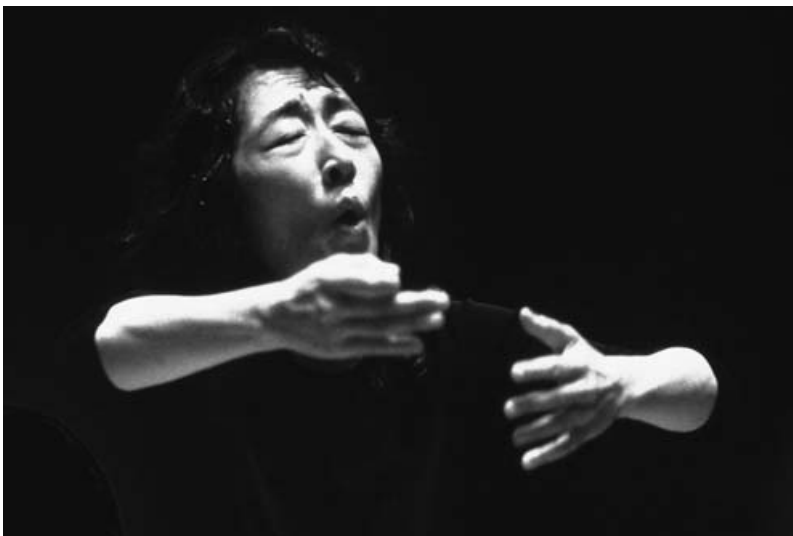
Figure 2 Mitsuko Uchida.

In some of these images it is as if the conductors themselves take on the appearance of imagined spirits, all but disembodied, with only their most salient features evident. Principal among these is the highly symbolic baton – itself possibly related subliminally to the wizard’s wand in the collective mind of the audience – and the hands that are so prominent in the performance of the dance. The face is also important, since through it we register our impressions of the musical spirits controlled by or possessing the shaman (see Figures 1 and 2). Such images, emphasizing the ethereal darkness within which we imagine the conductor operates, strongly suggest him to be a liminal, disembodied, almost ghost-like figure, a figure, in fact, who may very well be caught between this world and another.