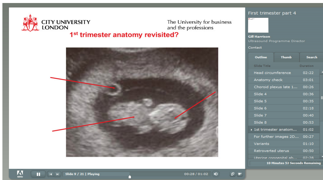
Image 1: An example of an adobe presenter on-line lecture, with interactive image labelling.