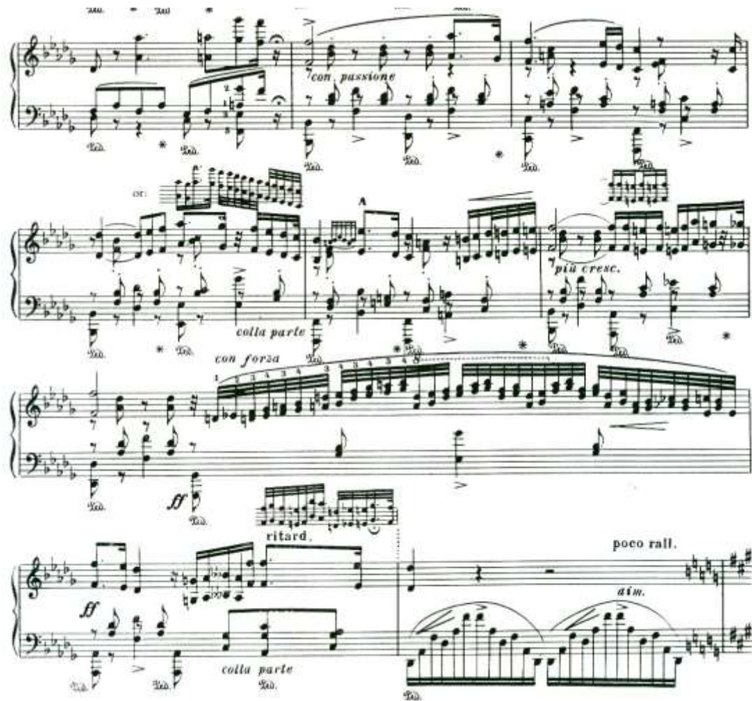
Fig. 11. Liszt, Grand Concert Fantasy from Sonnambula (Bellini).

But I wonder if a passage like this (or corresponding writing in the Réminiscences de Lucrezia Borgia , overloaded to the point of being almost comical) was really meant in a somewhat tongue-in-cheek fashion? And if so, how sincerely are the sentiment and passion to be put across in performance? Can the very overstatement of them give an ironic, parodistic quality to the music, or might one consider playing with a degree of knowing detachment?