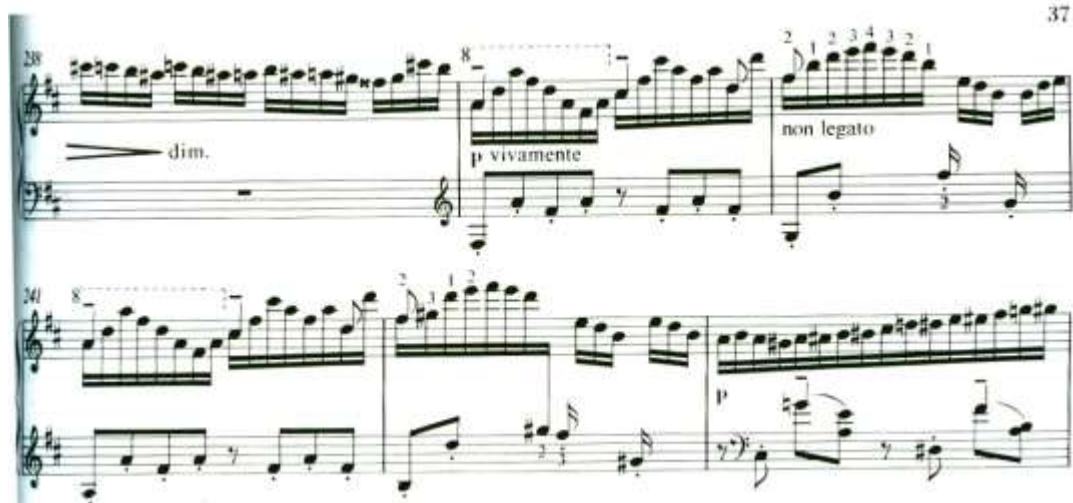
Fig. 7. Liszt, Sonata in B minor , bars 238-243.

This is the sort of effect that a colouristically-minded player like Horowitz performed exceptionally (for example in his recording of Vallée d'Obermann ), by which what would otherwise be simply decorative figuration comes to the foreground, as if threatening to engulf the basic line, thus causing another level of dramatic tension. In this and other moments of the Sonata, what might otherwise become a somewhat banal continual re-statement of the basic thematic material is presented in such a way that the configuration is almost more important than the material to which it is being applied. And an interpretative approach that stresses continuity of line and long-range harmony above all else can fail to capture this quality of excess which is to me such a fascinating aspect of Liszt's music.