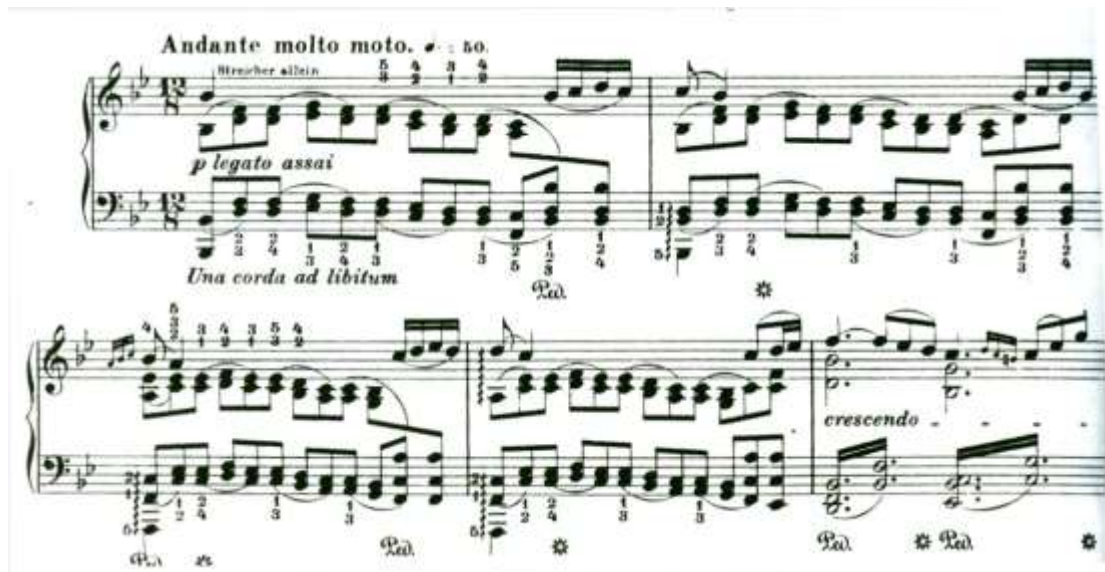
Fig. 15. Beethoven-Liszt, Symphony No. 6, “Pastoral”, opening of second movement.

So what else can be discerned, first of all, about the types of orchestra with which Liszt was familiar and favoured? His career as a conductor began in 1840 and ran through to 1884 77 , most intensively during his tenure as Kapellmeister in Weimar from 1848 to 1858. He conducted Beethoven symphonies and overtures in Weimar and Berlin in the early 1840s, and the Pastoral Symphony in Gotha in 1844, the only occasion recorded by Walker of him having conducted this work 78 . In 1845 Liszt conducted the Fifth Symphony in the festival to accompany the unveiling of the monument in Bonn (to the annoyance of Anton Schindler), as well as playing the Emperor Concerto 79 . Liszt’s conducting activities increased as his career as a touring virtuoso relaxed; however, by various accounts his skills as a conductor and the results he produced (not least as a result of the application of his theories of conducting) were at best mixed 80 .