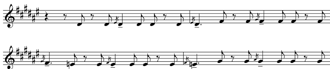
Fig. 9. Liszt, Mephisto Waltz No. 3, as often played.

In performances and recordings, almost invariably I hear pianists pedal the quavers with grace notes, especially those at the beginnings of bars (as well as top-voicing the passage). The variety of duration thus produced then makes it more akin to a melodic line (Fig. 9).