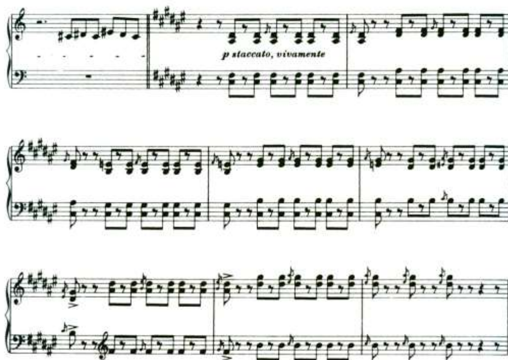
Fig. 8. Liszt, Mephisto Waltz No. 3.

I feel the temptation to ‘humanise’ this piece, softening its edges, can counteract such a possibility. Fig. 8 shows the first appearance of the staccato figures which come to accompany the espressivo theme.