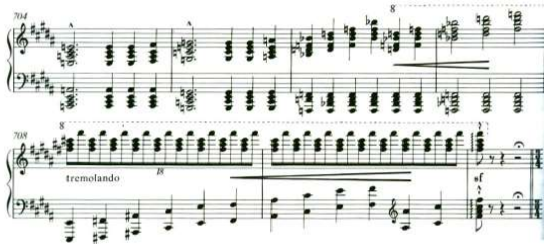
Fig. 5. Liszt, Sonata in B minor , bars 704-710.

The ‘slow movement’ provides some repose from all this, using sustained sonorities continuously, rightly through to the final return of the ‘damped timpani strokes’ (bar 453). But the high degree of edgy staccato writing in the fugue counteracts this, once again acting as a textural/articulative counterpart, only here the contrast is more on the macroscopic level. And so it continues, up to the wrenched sf that cuts short the final appearance of the ‘Grandioso’ theme (Fig. 5).