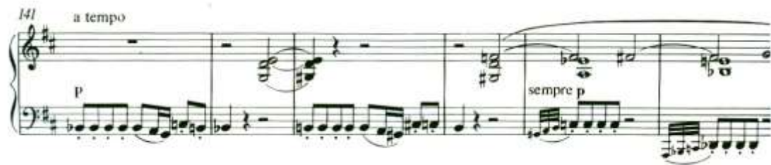
Fig. 2 Liszt, Sonata in B minor , bars 141-146.

Throughout the whole of the Sonata , sustained legato melodic lines are countered by their opposite, sinister staccato utterances, creating an extended conflict between the two types of material. A passage like Fig. 2 shows this process clearly.